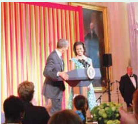
The First Lady welcomes the President, who surprised guests by stopping by the dinner to say hello.