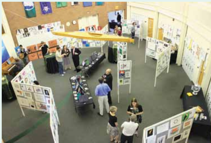
Student art on display in the Big Room. Note the student-made kayak, high above!